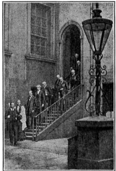
Apothecaries in Procession. —The Society of Apothecaries in London leaving their hall, October 30th to attend the Master's Day Service at St. Andrews by the Wardrobe.

interest in London. All medical officers, dental surgeons and pharmacists belonging to, or having belonged to, the forces of all nations admitted to membership of the League of Nations, are invited to the Congress, and also all officers belonging to organizations in association with the Medical Services. The subscription is fixed at 10s. for gentlemen, and 7s. 6d. for ladies. This entitles the subscriber to copies of the official reports and to participation in the official excursions and receptions organized for the Congress. Congressists must notify the Secretary of their intention to be present as early as possible before January 1929, and at the latest by February 1st. The railway companies in Great Britain and Ireland have agreed to issue first- and third-class tickets available from May 4 to 13, 1929, at the ordinary single fare, and one-third for the double journey for all those attending the congress."